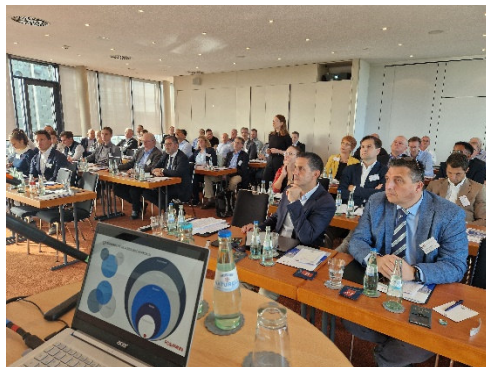
Room with a view: High interest in this year's HPL summit in Hamburg